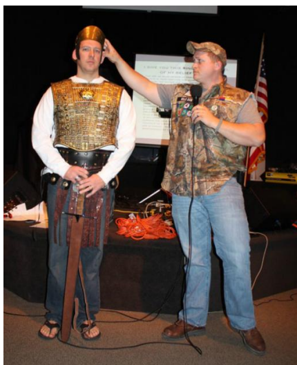
illustration of the breast plate.

The LORD [is] a man of war; The LORD [is] His name.