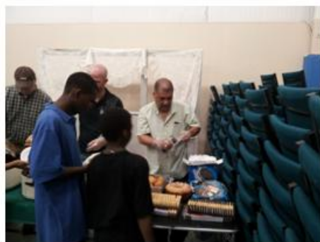
Lighthouse Serving Food