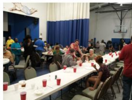
Fellowshipping With Families