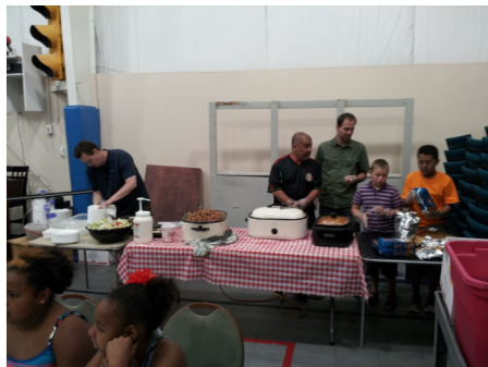
Getting Ready For The Crowd