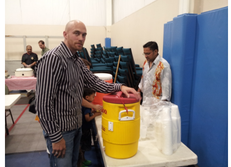
Rebar Guarding Punch Cooler