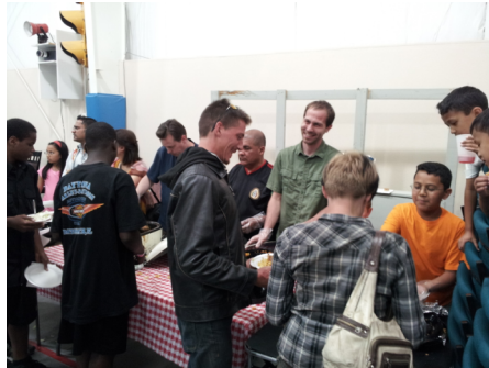
H2O, Lighthouse, Shep and VM's Kids Serving