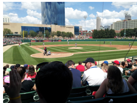
Awesome View And In The Shade