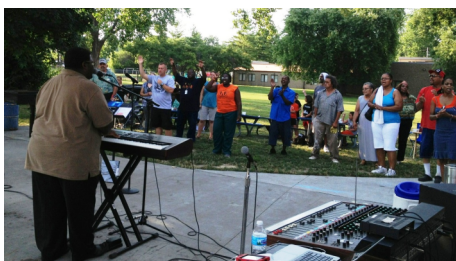
Praise And Worship