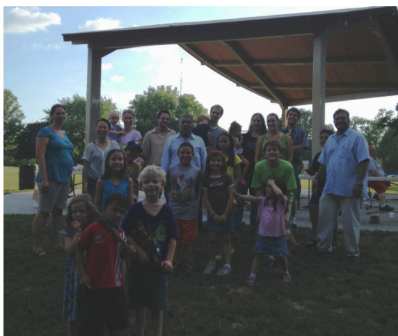
WAHrriors – Wives – Kids and Sheps Church The Team That Fed The Multitude

The following are WAHrriors who made it a point to make it one time to this location.