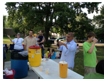
Lighthouse Setting Up Drink Table