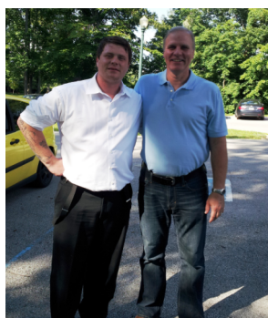
O2 Warrior and Spear