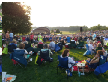
Grounds Are Packed