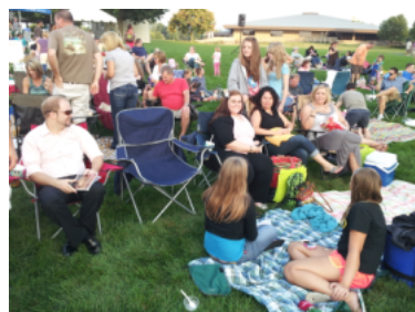
Setting Up For A Picnic

We had a few WAHU Families meet @ Conner Prairie on August 10th for The Contours Performance which they sang Motown hits. It was a blast, there was fellowshiping, eating and dancing. Weather was great. Hope to see more of you at the net outing.