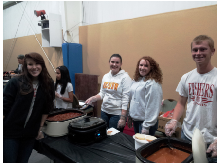
Young People From Life Church First Time @ City View