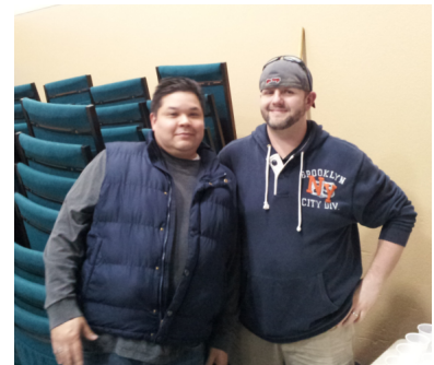
Cabee Showing The Ropes To STUB On How It Is Done

The following are WAHrrriors who made it a point to make it one time to this location.